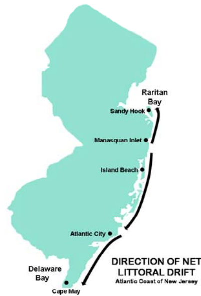
Figure 1. Arrows indicating the net direction of sand movement along the coast of New Jersey.

Another way to determine the net direction of sand movement along the coast is to look at the average size of the sand grains. Larger sand grains are always found close to the source of sand in motion. In New Jersey the largest grains are found near Manasquan Inlet (0.78 mm) and the finest in Sandy Hook to the north (0.34 mm) and Wildwood (0.20 mm) to the south.