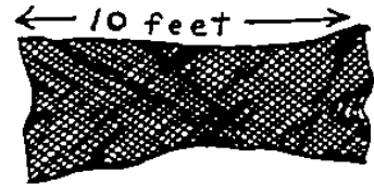
Netting or mesh material